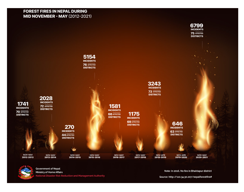
Figure 1: Number of forest fires in Nepal, 2012–21.

houses are destroyed (Bajracharya 2002). The number of reported fires varied considerably from 2012 to 2021, however (Figure 1), reaching an unprecedented level in the 2020–21 forest fire season, with 6,799 fires reported—ten times more than the previous season and three times more than the average in the previous eight years. The occurrence of forest fires is increasing, at least in part as a consequence of regional warming and extended dry spells (Sharma and Goldammer 2011) and of growing aridity and hydrological changes (NCVST 2009). There were many forest fires in March 2009, for example, causing huge plumes of smoke (Figure 2).